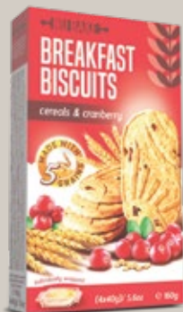
CEREALS & CRANBERRY