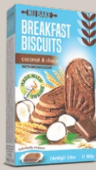
COCONUT & CHOCO