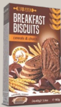
CEREALS & CHOCO