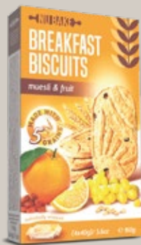
MUESLI & FRUIT