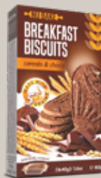
CEREALS & CHOCO