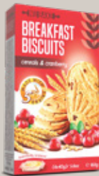
CEREALS & CRANBERRY