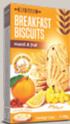
MUESLI & FRUIT