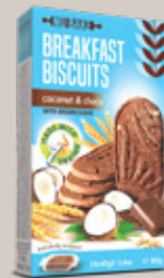
COCONUT & CHOCO